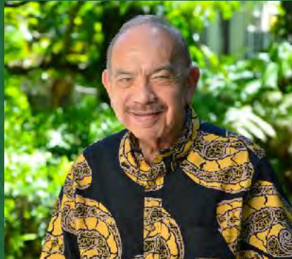
Governor JOHN WAIHEE